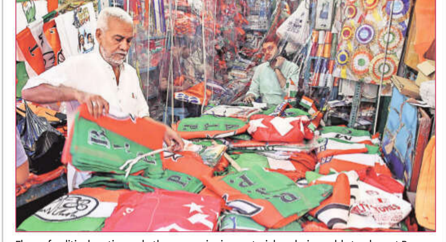
Flags of political parties and other campaigning material are being sold at a shop at Bara Bazar, in Kolkata on Friday. West Bengal will vote in two phases — April 23 and April 29